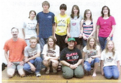
A 2010 Summer Serving Team

Don't forget that you can go online and nominate Crossroads to be the recipient of the $1000 community grant that Applewood Plumbing and Heating awards each month. You can nominate CRR at any time, just go online to www.applewoodfixit.com and then click on the "Community Giveaway" on the right hand side of the home page (down a ways).